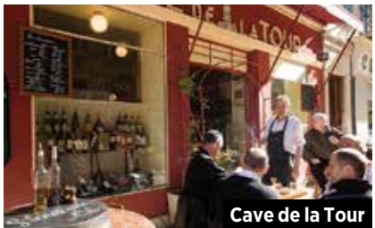
Cave de la Tour

Cosy wine shop and bar on one of the prettiest squares in Vieux Nice. This is a must-visit for anyone interested in Nice wine, stocking every producer from the region and serving classic Niçois fare at lunchtime, including a traditional stockfish