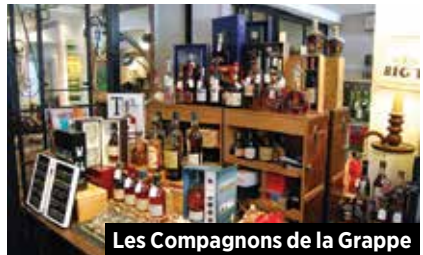
Les Compagnons de la Grappe

tramline construction on the doorstep of his Place Garibaldi wine shop and plans to celebrate its completion later this year by adding a gourmet food counter to the shop to complement his wine selection. Specialising in rare wines and old vintages, Reno is also lauded for his ➤