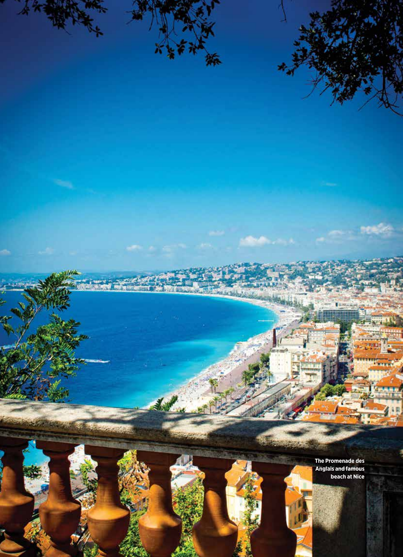
The Promenade des Anglais and famous beach at Nice