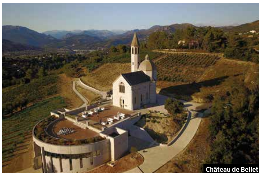
Château de Bellet

With sports star ambassadors and a trendy industrial estate address beneath the Bellet vineyards, Blue Coast is leading the local craft drinks revolution. On the first Saturday of the month its smart taproom opens to the public, its three boutique brews enjoyed with live music, a food truck and a chilled, family-friendly vibe. www.bluecoastbrewing.com